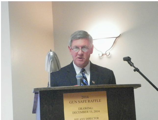
NY State Senator Rich Funke * 55 th Senate District

New York State Senator Rich Funke * 55 th Senate District signed the S.C.O.P.E. PLEDGE. Please sign the online petition at www.scopeny.org by Feb. 27. (SCOPE Officers are visiting legislators on Lobby Day in early March.)